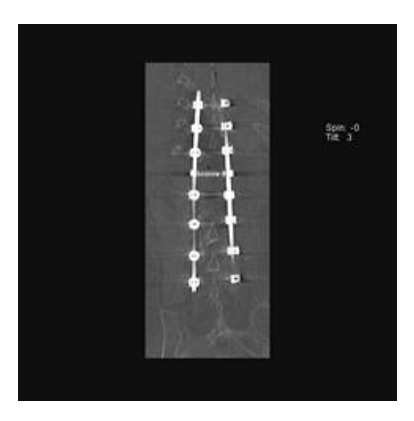
Figure 3. Postoperative MRI of the spine (coronal view, fixation of T9 through L4 vertebras with pedicle screws and rods).

Metastatic breast cancer can most commonly involve bones (70% of breast cancer metastases), lungs, lymph nodes, liver, gastrointestinal tract, or brain<sup>4</sup>. Bone metastases usually have a predominant attraction for axial skeleton, which was thought to be related to the presence of red bone marrow. Bone invasion can present as osteonecrosis, fracture, or osteolysis, which significantly impacts the patient's quality of life<sup>7</sup>. Bone metastases can also induce bone lysis and hypercalcemia via PTHrP secretion. They can also secrete paracrine factors (cytokines) which stimulate the osteoclasts and inhibit the osteoblasts<sup>8,9</sup>. Osteolytic lesions can induce pathological fractures, pain, nerve compression, and most severely a spinal cord compression which happened in our patient. In breast cancer patients with uncontrolled bone metastases, the five-year survival is lower than 20\%^{10} .