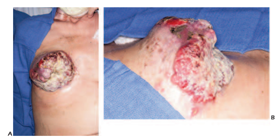
Figure 1. A, Large fungating ulcerating mass arising from the right breast, coronal view. B, Large fungating ulcerating mass arising from the right breast, oblique-lateral view.