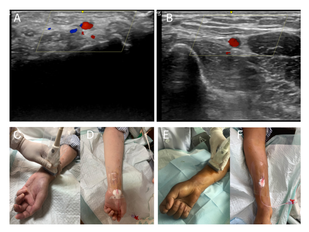
Figure 1. Ultrasound-guided radial artery catheterization. A , Short-axis view of the radial artery at the wrist level displaying arterial blood flow. B , Short-axis view of the radial artery at the mid-forearm level displaying arterial blood flow. C , Radial artery at the wrist localized by ultrasound. D , Radial artery catheterization at the wrist level. E , Radial artery in the mid-forearm localized by ultrasound. F , Radial artery catheterization at the mid-forearm level.

mode (Vascular), with an 8 MHz frequency and 3 cm depth. The gain and depth were adjusted to obtain the best view acceptable to the operator. A 20-GA intravenous catheter was used as the puncture needle (BD Angiocath<sup>TM</sup>, Sandy, UT, USA).