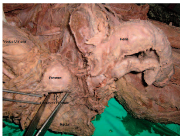
Figure 1. Levatores prostate area on cadaver.

First longitudinal plane imaging was made by TRUS. Twenty-two gauge needles were introduced guided by TRUS with proper angle on linea dentate caudally. Mucosa was passed with needle 4 centimeters above this line. 0.5 ml of lidocaine was injected left and right sides of the point which is in the middle of the imaginary