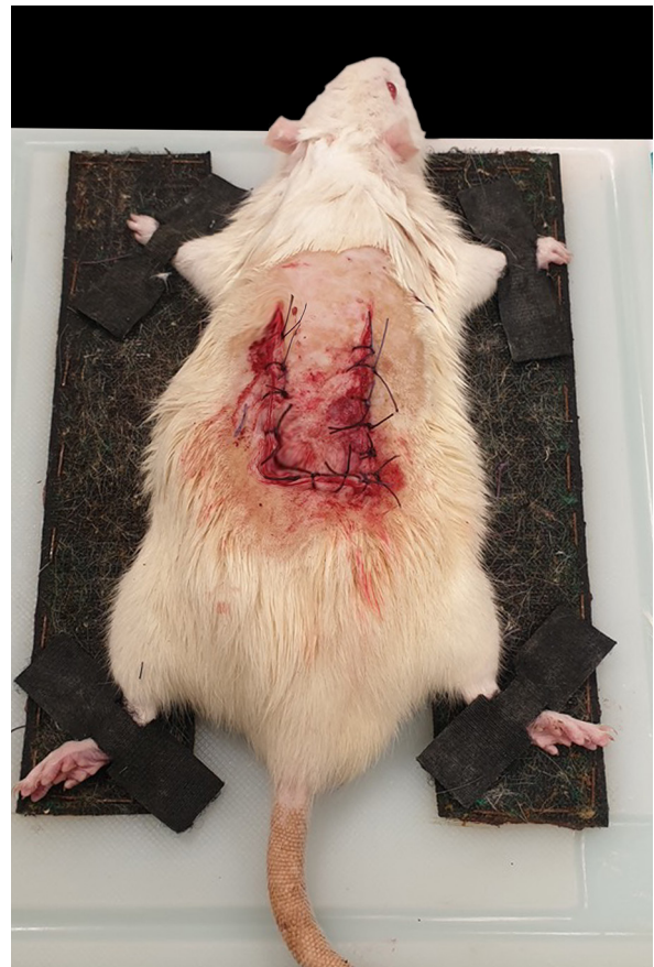
Figure 2. The flap was sutured back into the site from which it had been taken.

as 1.1, 1.2 up, to 1.7. The control group treatment consisted of applying petroleum jelly only to the margins of the flap, performed two times daily. In the intervention group, the animals numbered 2.1, 2.2, to 2.7. These rats underwent twice daily application of vaseline, containing, in addition, hyaluronidase (Hyaluronidase PB3000, PBSerum Medical, Madrid, Spain) at a concentration of 1,500 units per gram, to the margins of the flap.