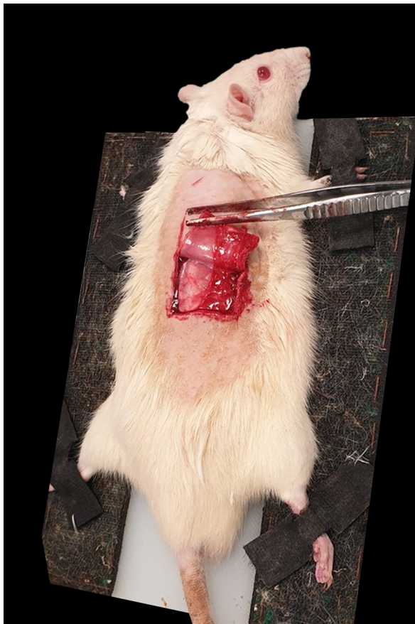
Figure 1. The flap measuring 3 cm by 10 cm was harvested from the skin of the back.

McFarlane 10,11 has described the method used. The rat was administered a general anesthetic, following which a flap measuring 3 cm by 10 cm was harvested from the skin of the back. The same flap was then sutured back into the site from which it had been taken 10,11 (Figures 1, 2). All 14 rats underwent an identical operation. The rats were then randomized to an intervention or control group. The animals in the control group were designated